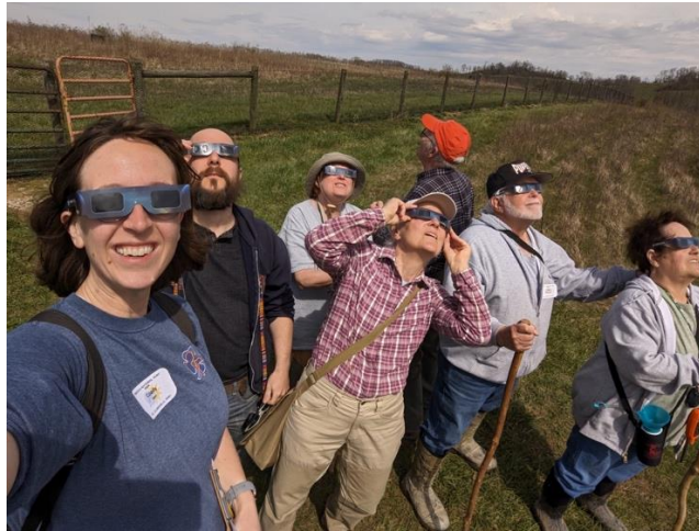
Watching the Eclipse on Monday!