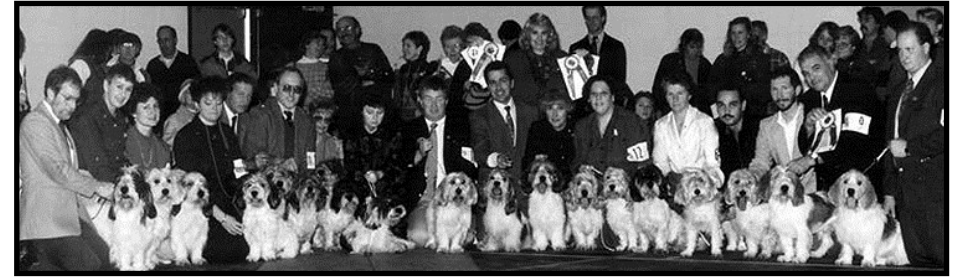
Entry at first AKC Show