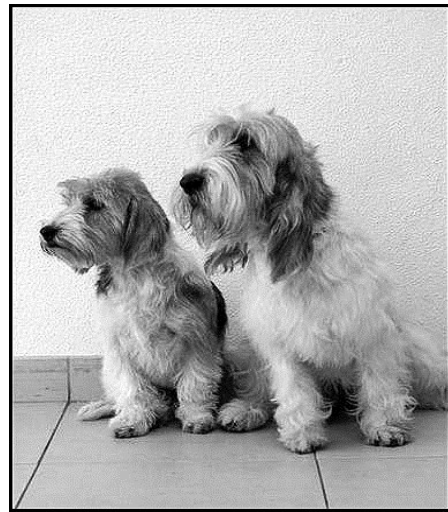
Comparison pictures of Petit and Grand Basset Griffon Vendéen

It continues to be a common misconception that height is the most significant feature which